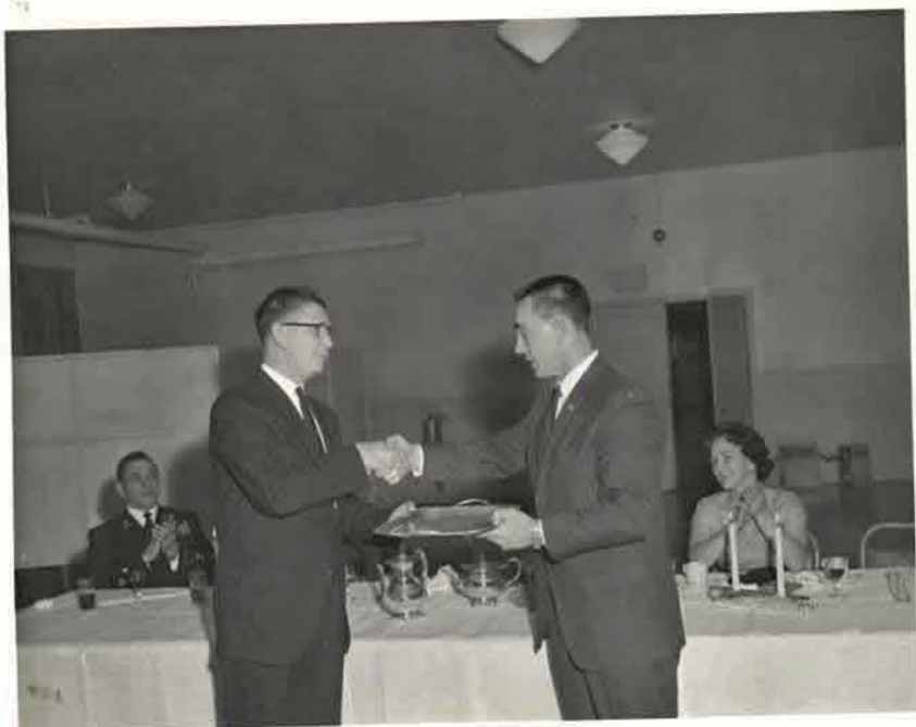
H.M.C.S. CORNWALLIS NEG. NO. DB. 19198... DISPO L x HQ D DEPT. N/INFO... DATE. 5-12-64... CAPTION.....