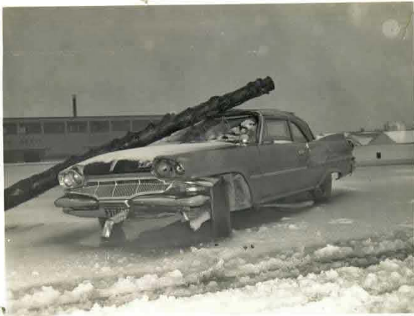
H.M.C.S. CORNWALLIS NEG. NO. DB. 19196... DISPO L x HQ D PHOTOG. ESTENSEN... DEPT. N/INFO... DATE. 1-12-64... CAPTION..... SAFE DRIVING WEEK VIEW OF WRECKED CAR.