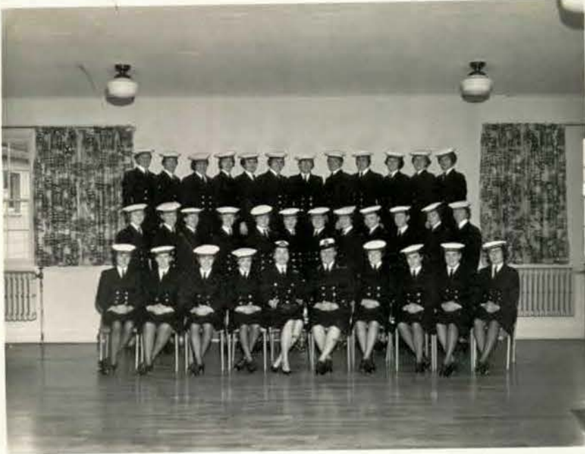
H.M.C.S. CORNWALLIS NEG. NO. DB. 19526 DISPO L x HQ D DEPT. WRENS DATE. 5-12-64 CAPTION..... WRENS DIV. PHOTO