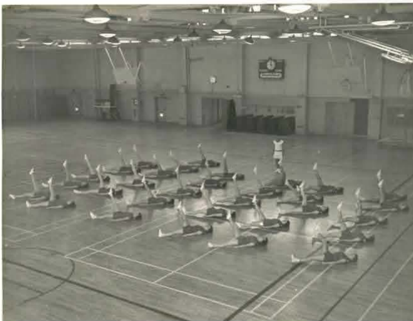
H. M. C. S. CORNWALLIS NEG. NO. DE. 19530..... DISPO L * HQ D DEPT. Part..... DATE. 16-12-64..... CAPTION..... WRENS GYM DISPLAY.....