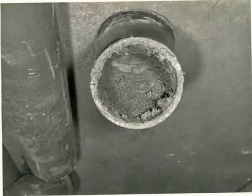
H.M.C.S. CORNWALLIS NEG. NO. DE. 19527 DISPO L x HQ D DEPT. WORKS DEPT. DATE. 16-12-64 CAPTION..... PIPE CORROSION