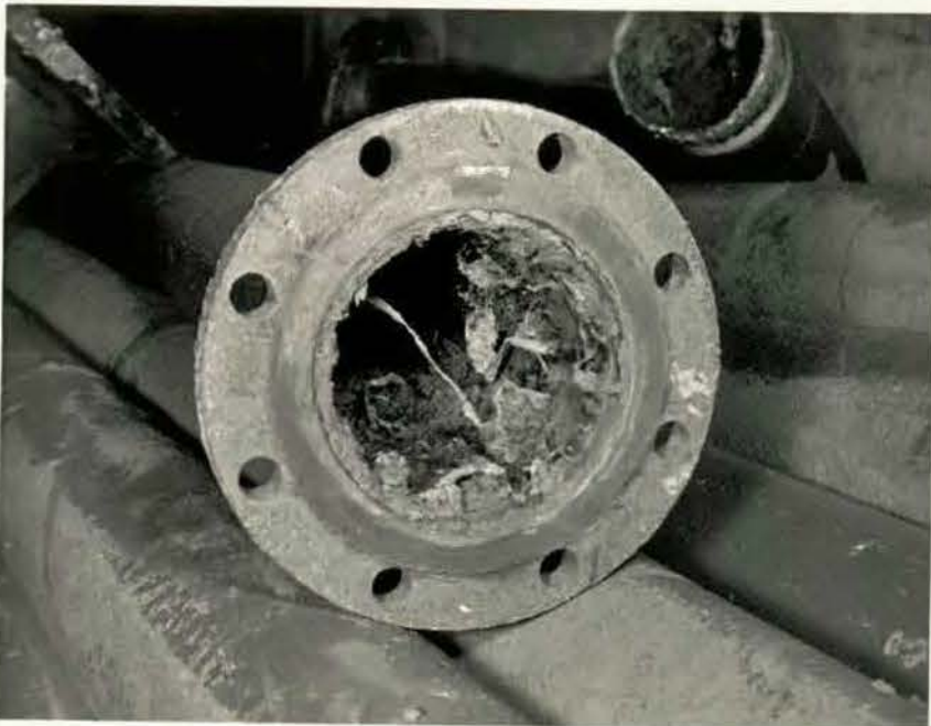
H.M.C.S. CORNWALLIS NEG. NO. DE. 19528 DISPO L x HQ D DEPT. WORKS DEPT. DATE. 16-12-64 CAPTION..... PIPE CORROSION