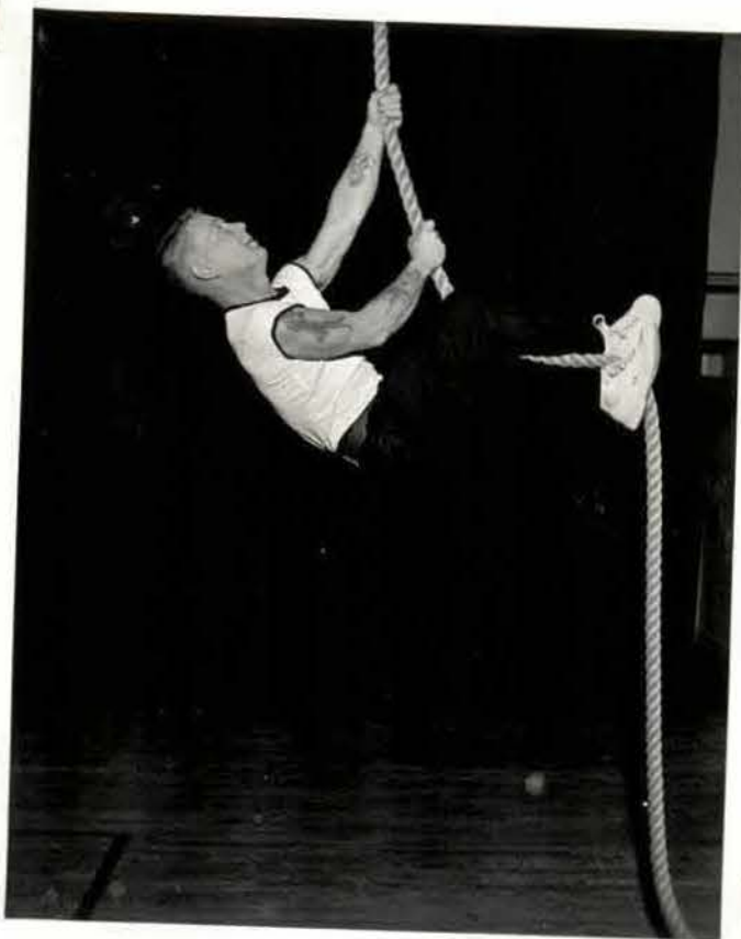
H.M.C.S. CORNWALLIS NEG. NO. DB. 19540.... DISPO Lx HQ D DEPT... P&RT..... DATE... 18-12-64..... CAPTION.....