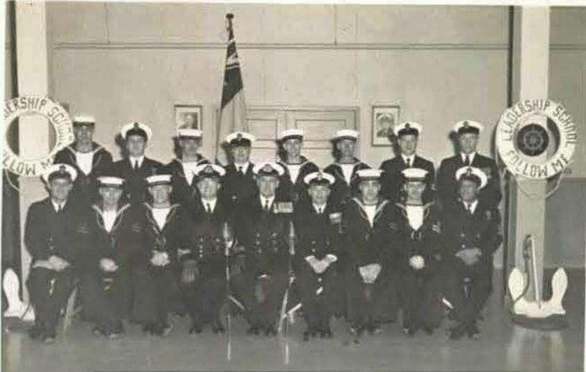
19505 H.M.C.S. CORNWALLIS NEG. NO. x DB..... DISPO L ESTENSID PHOTO G.I./SHIP. SCHOOL DEPT. 1-12-64..... DATE..... CAPTION..... RESERVE PO CLASS.