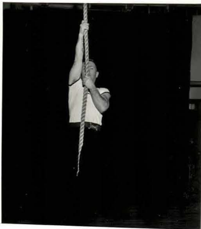
H.M.C.S. CORNWALLIS NEG. NO. DE. 19539.... DISPO Lx HQ D DEPT... P&RT..... DATE... 18-12-64..... CAPTION.....