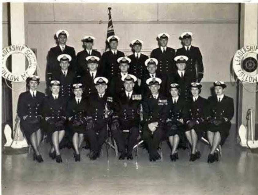
H. M. C. S. CORNWALLIS NEG. NO. DB. 19502.. DEPT. L/SHIP SCHOOL... DATE. 1-12-64..... CAPTION.....