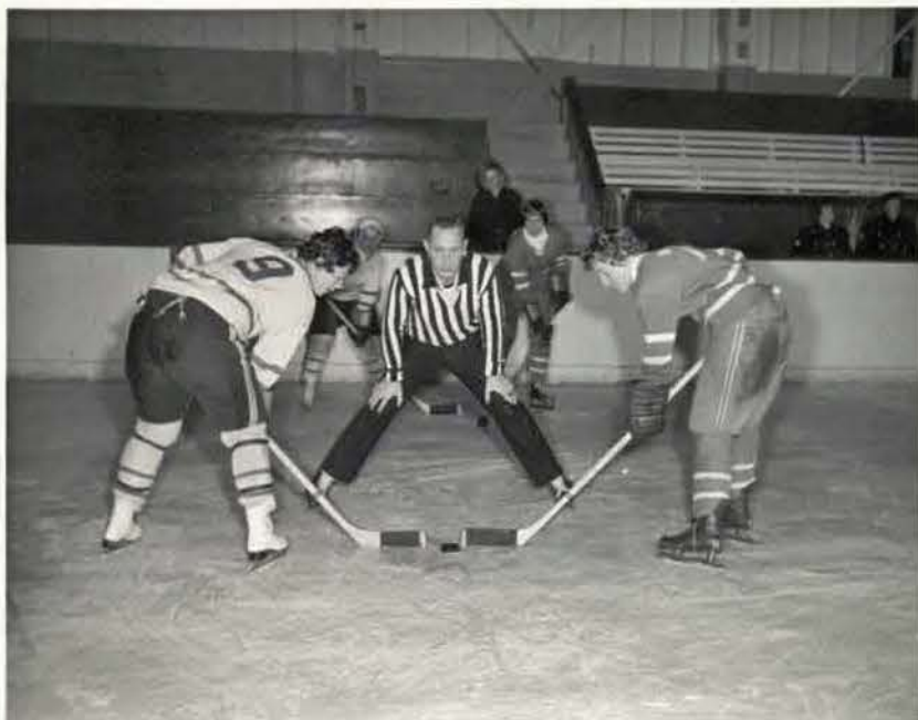
19507 H.M.C.S. CORNWALLIS NEG. NO. x DB..... DISPO L ESTENSID PHOTO G.P.&RT..... DEPT. 9-12-64..... DATE..... CAPTION..... WRENS HOCKEY GAME.