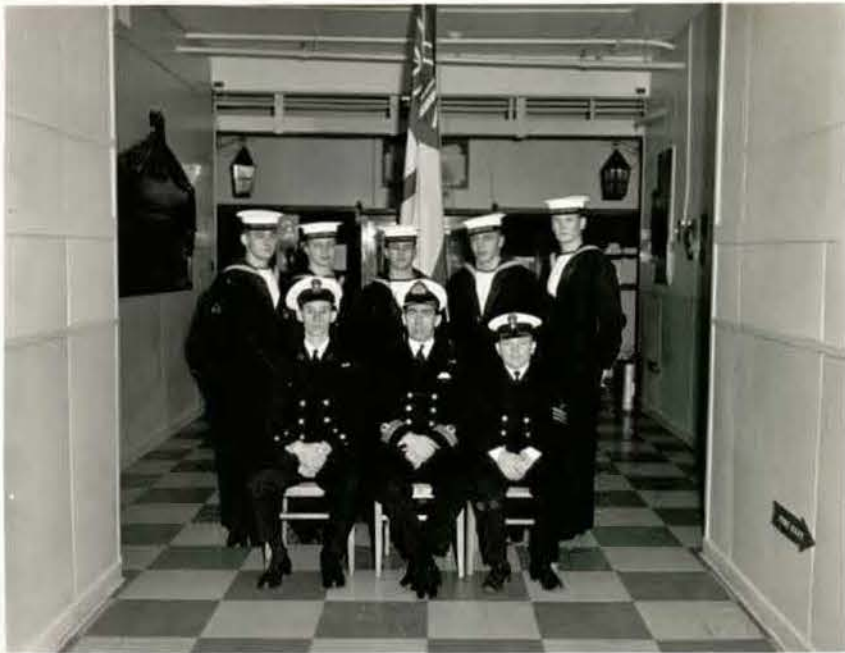
H.M.C.S. CORNWALLIS NEG. NO. DB19535..... DISPO Lx HQ D DEPT. COM. SCHOOL..... DATE. 17-12-64..... CAPTION..... SG.140 CLASS PHOTO