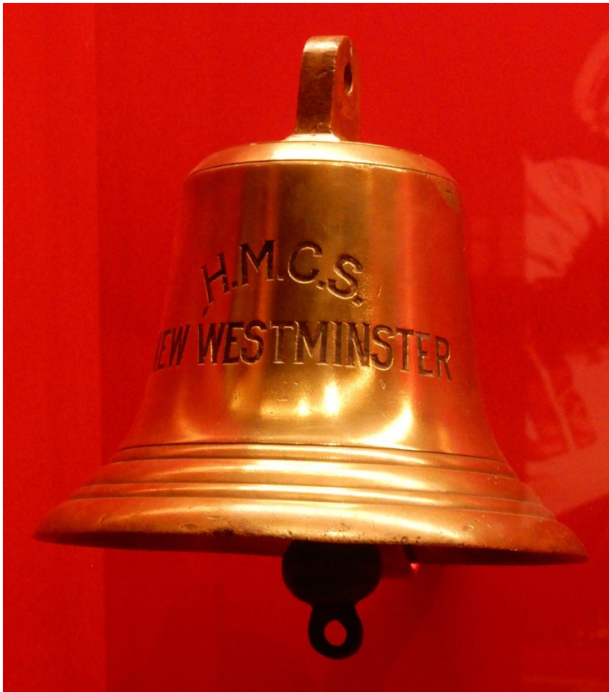
Ship's bell of HMCS New Westminster