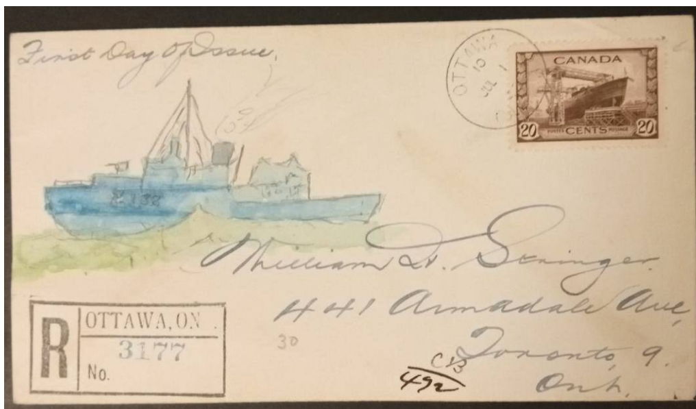
FDI envelope