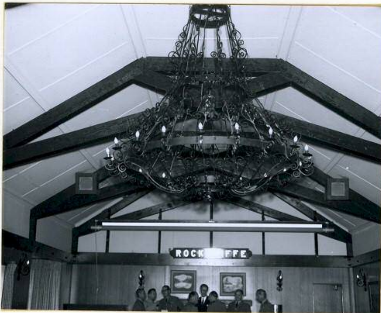
The BELL in the Chandelier