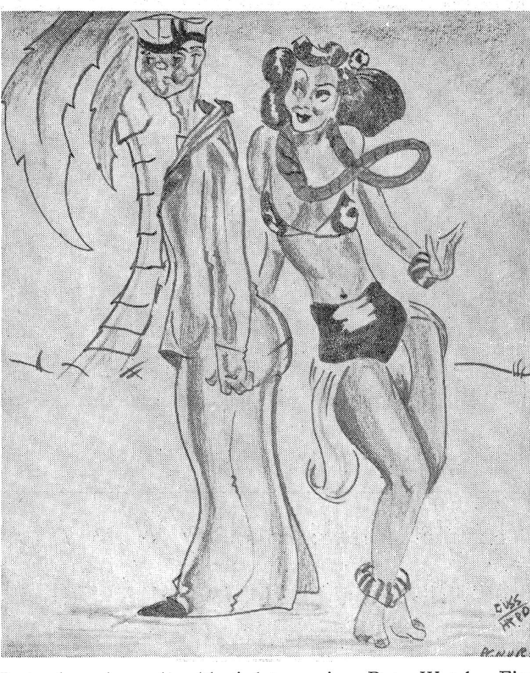
Just when she makes 'that' date you're Duty Watch, Fire Party, Compulsory Study, or have to read Night Flashing or a Buzzer Exercise.

"You ask the gal to kiss you," he says, "And, before she can say no, it's too late."